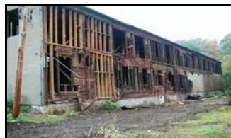
Before and after: "Island Bag Mill" bldg (top)

For WAM Leasing information, please contact ACO Property Advisors in Saratoga @ 584-9578 or Jim Dalpe at 791-0545.